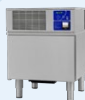
SINGLE-CAVITY Reach-in Units

Thermo-Kool has a Blast Chiller & Shock Freezer that's the perfect fit for every kitchen