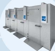
MULTI-COMPARTMENT Roll-in Units