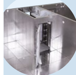
INTEGRATED Roll-in Units