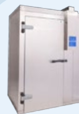
STANDALONE Roll-in Units