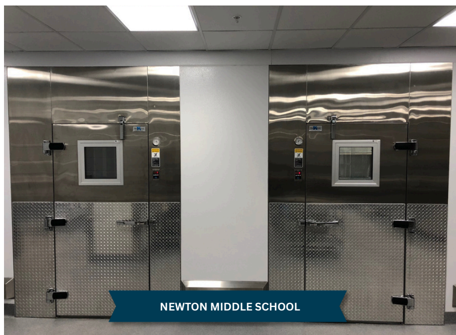
NEWTON MIDDLE SCHOOL

Even today, the lunch bell is a coveted sound that's part freedom and part fresh food. But while everyone remembers the cafeteria itself, nobody really talks about the cold storage working quietly behind the scenes to keep all that food safe, fresh, and ready for the lunch rush.